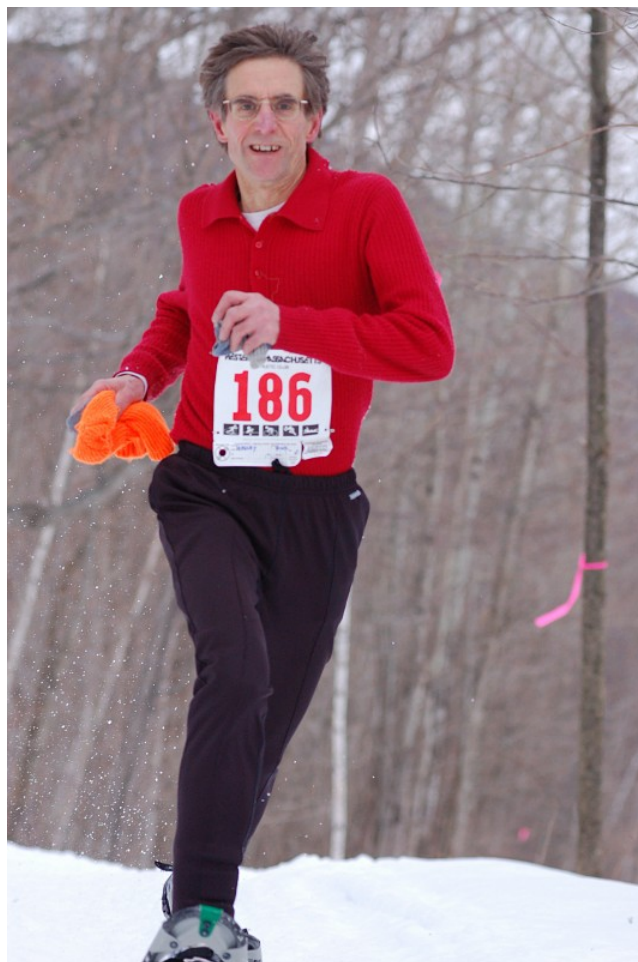
03/04/07 Greylock Glen.