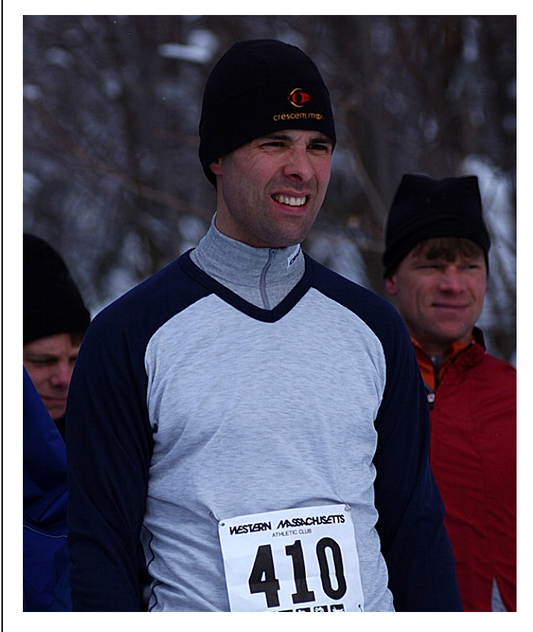
At the Start of 2003 South Pond Shuffle